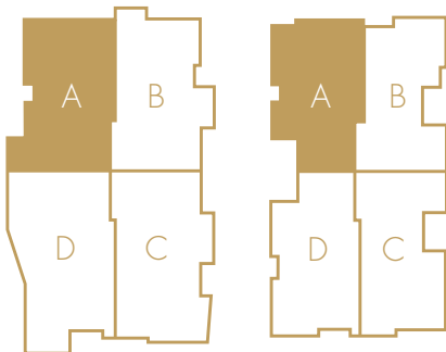
PENTHOUSE LEVEL 2